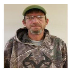
Charge/Offense Indecency with a child sexual contact.