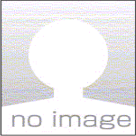
Xavier Rodriguez, 27

Charge/Offense Pornography involving juveniles.